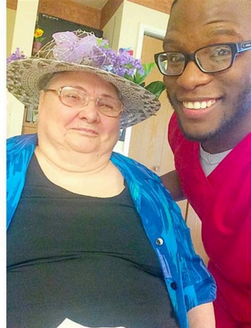
I will always love you Zona <3